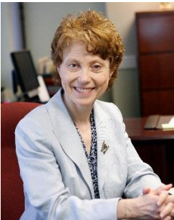
NORA NEWCOMBE, PH.D. P.I. OF THE SPATIAL INTELLIGENCE AND LEARNING CENTER TEMPLE UNIVERSITY